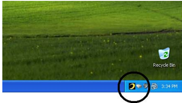
Figure 2 WSM Client icon (left) and WSM Virtual Disc icon (right)

The color of the WSM Client icon depends on your WSM Client status in relation to the WSM server: